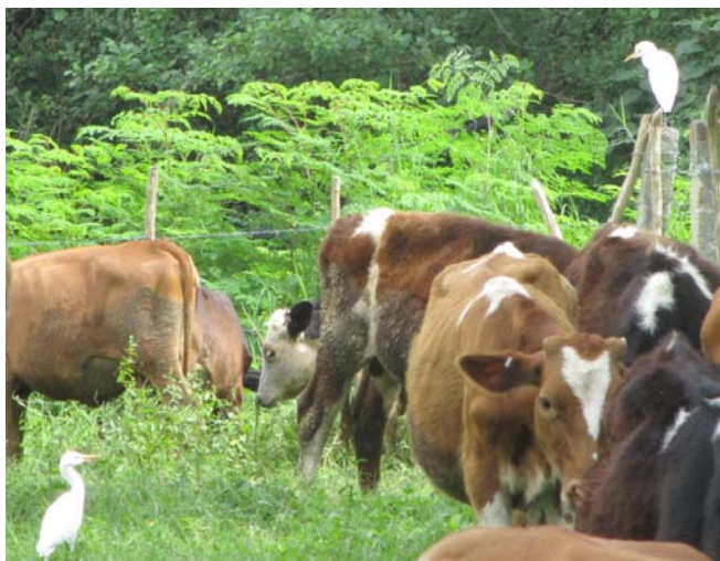
Western Cattle Egrets foraging between cattle in Cuba demonstrate that humans are not the only species which benefits from dairying.