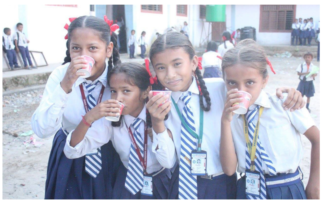
World School Milk Day was celebrated in Nepal

World School Milk Day was celebrated on the last Wednesday of September. This day fosters a better understanding of dairy products, including where they come from, how dairy products are made, their nutritional composition and how they fit into the overall diet. IDF has gathered a variety of worldwide initiatives from its members. Have a look at the <u>IDF Website</u>!