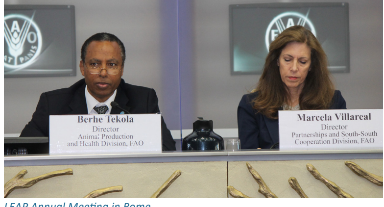
LEAP Annual Meeting in Rome

LEAP Steering Committee members recognized new partners from Brazil, Canada, Hungary and Uruguay and reviewed the progress of the four active Technical Advisory Groups (TAGs) as well as the formation of the newest TAG on Feed Additives. Members emphasized the critical importance of road testing the guidelines to ensure they are useful from a practical perspective, as well as effectively communicating about LEAP's work.